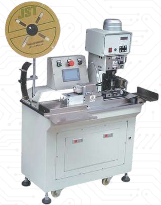
WIRE CRIMPING MACHINES