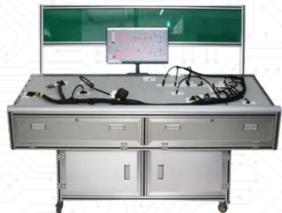
WIRE HARNESS TESTER BENCH