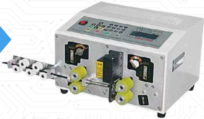
AUTOMATIC WIRE CUTTING AND STRIPPING MACHINE