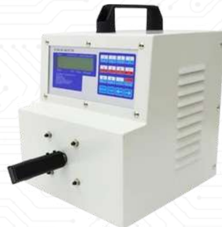
AUTOMATIC WIRE TWISTER MACHINE