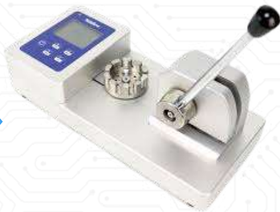
WIRE TERMINAL PULL TESTER MACHINES