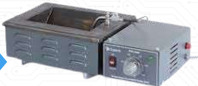
WIRE TINNING SOLDAR POT