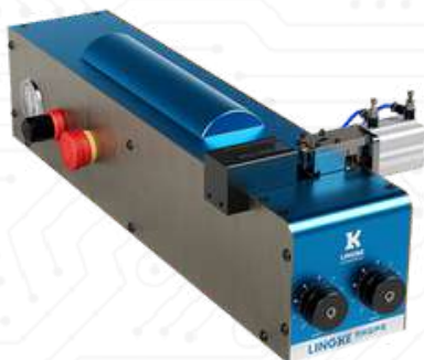
ULTRASONIC WIRE HARNESS WELDING MACHINE